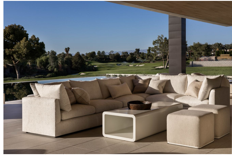
The property has swimming pools in the backyard, courtyard and primary bathroom. SHADE DEGGES (2)

The property also has a one-bedroom, roughly 1,200-square-foot guest casita.